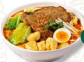
👍 檳城喇沙豬扒米線 Penang Laksa with Pork Chop and Rice Noodles