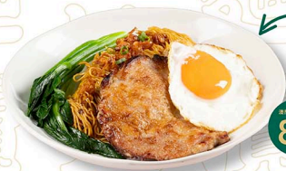
招牌豬扒煎蛋蔥油撈麵 Tossed Noodles with Pork Chop and Egg in Spring Onion Dressing