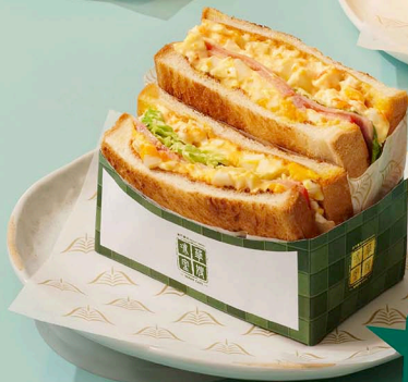
招牌蛋沙律多士 Waso Toast with Egg Salad 澳門元 42 MOP 42