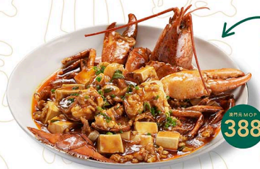
麻婆豆腐燒 波士頓龍蝦 Mapo Tofu with Boston Lobster