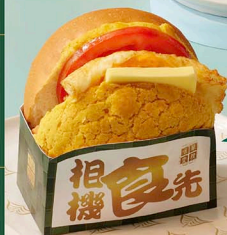
招牌菠蘿包 Waso Pineapple Bun 澳門元 35 MOP 35