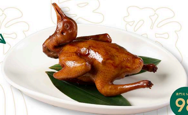
👍 瑞士乳鴿 Braised Baby Pigeon in Swiss Sauce