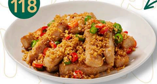
椒鹽無骨豬扒 Deep-fried Pork Chop with Spicy Salt and Pepper