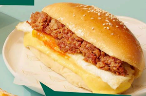
招牌芝士 鹹牛肉蛋軟豬 Waso Soft Bun with Cheese, Corned Beef and Egg 澳門元 45 MOP 45