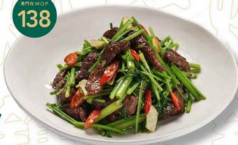
香菜爆孜然牛柳條 Stir-fried Beef Tenderloin with Coriander and Cumin