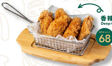
👍 香辣炸雞翼 Deep-fried Spicy Chicken Wings