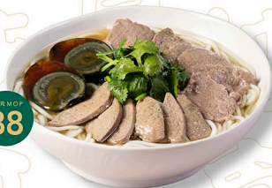
👍 豬潤牛肉皮蛋芫茜米線 Pork Liver and Beef with Rice Noodles in Century Egg and Coriander Soup