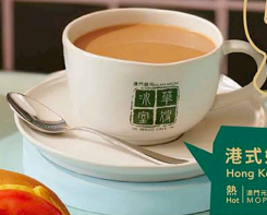
港式奶茶 Hong Kong Style Milk Tea 熱 | 澳門元 25 凍 | 澳門元 28 Hot | MOP 25 Cold | MOP 28