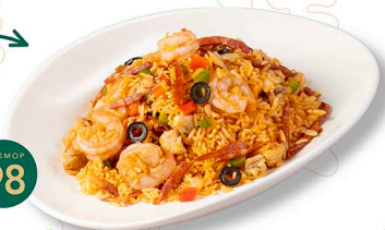
西洋炒飯 Fried Rice in Tomato Sauce