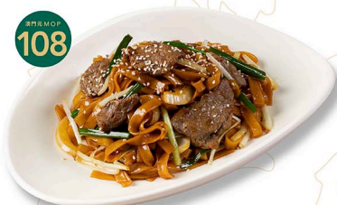
泰式炒貴刁 Pad Thai