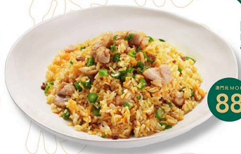
鹹魚雞粒炒飯 Fried Rice with Chicken and Salted Fish