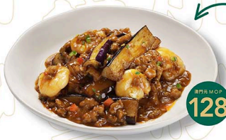
魚香蝦仁燒茄子 Braised Eggplant with Minced Pork and Salted Fish