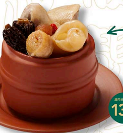
花膠羊肚菌燉乳鴿 Double-boiled Soup with Fish Maw, Morels and Pigeon